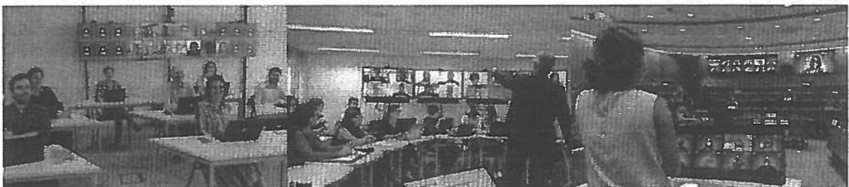
Figure 2: Generic visual examples of HyFlex classroom spaces and teaching environments.

No; new faculty will have an office in Felmley Hall or Felmley Annex. Instruction is online or existing in-person classes. Classroom maintenance costs for recording or live sessions is supported through operating/donor/FCR funds in the proposal above. However, an initial cost of $80k is needed to create a HyFlex classroom in the Felmley Hall of Science Annex. Generic examples are shown below in Figure 2.